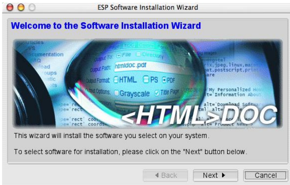
Figure 1-2: The software installation wizard

Double-click on the Install icon in the Finder window to start the software installation wizard (Figure 1-2) and follow the installer prompts.