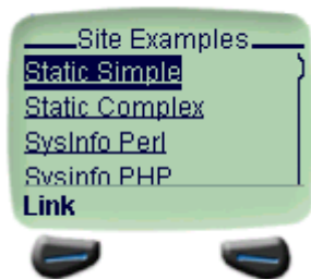
Figure 12.2: Site Examples index

6. The card in Figure 12.2 is displayed.