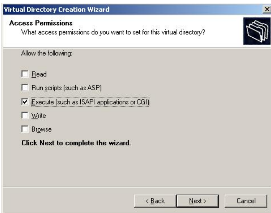
Figure 5-7: Enabling CGI Mode