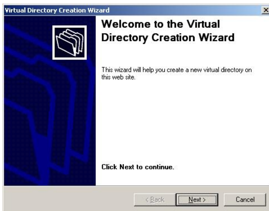
Figure 5-4: The Virtual Directory Creation Wizard Window