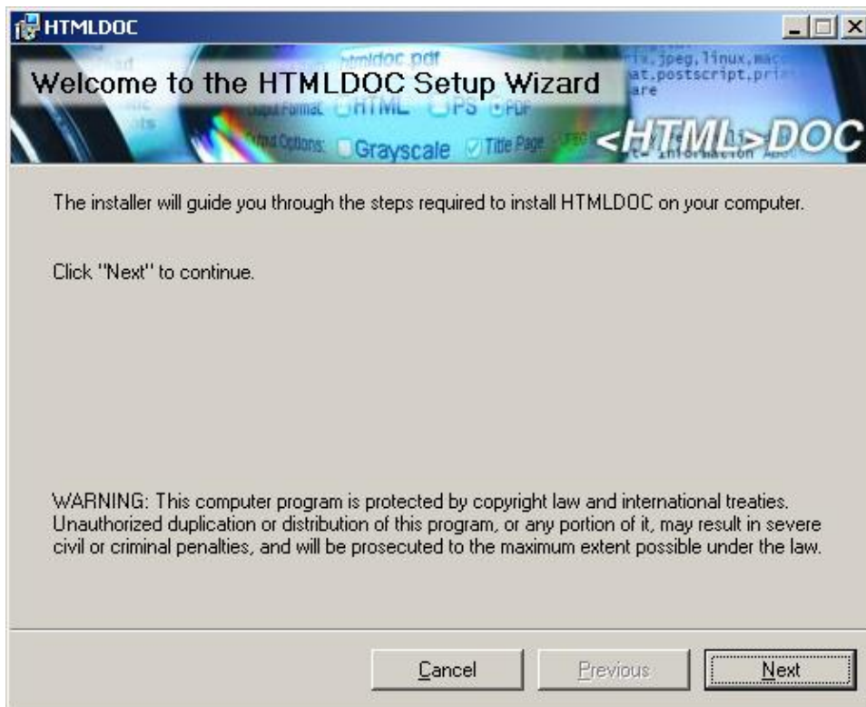
Figure 1-1: The Microsoft software installation wizard