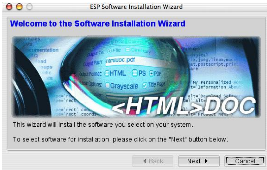
Figure 1-2: The software installation wizard

Double-click on the Install icon in the Finder window to start the software installation wizard (Figure 1-2) and follow the installer prompts.