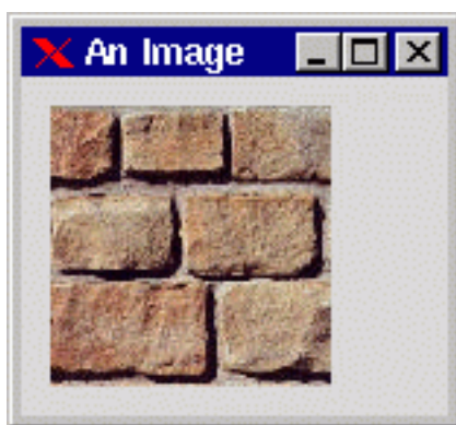
Figure 8.7: Canvas Image Object

The canvas image object displays images and moves them around in a simple way. The currently supported image formats are bitmap and gif.